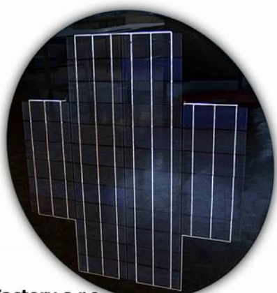
Fill Factory s.r.o. 48 Wp, Diameter=75 cm